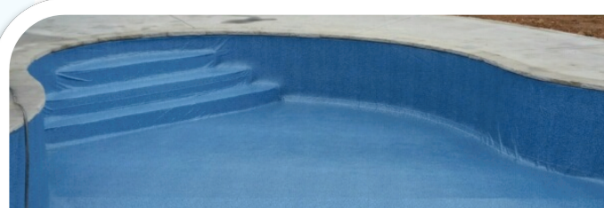
Wrinkles in the liner during filling process are also common

Liner Installation: The installation of the liner may take place before or after the concrete decking, depending on timing and your project requirements. Once the liner is dropped in the pool, we will need a water source and garden hose to fill the pool as part of the installation process. The pool will be filled in stages. You may be asked to start and stop the filling of the pool as water reaches certain levels based on the design of your pool. While your liner is installed you will hear a vacuum(s) running. This vacuum(s) is removing air from behind the liner as it fills with water. Although noisy, it is imperative that this device(s) runs continuously through the initial stages of filling. A crew member will instruct you to stop filling the pool when the water reaches a certain level and to turn the vacuum(s) off as well. If the vacuum(s) shuts