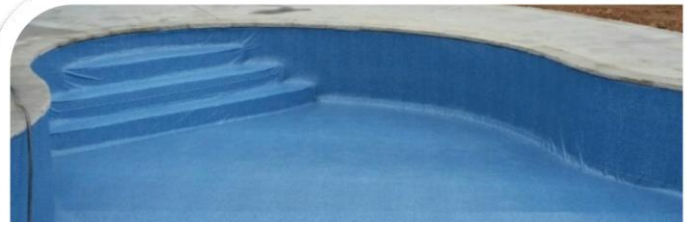
Wrinkles in the liner during filling process are also common

Liner Installation: The installation of the liner may take place before or after the concrete decking, depending on timing and your project requirements. Once the liner is dropped in the pool, we will need a water source and garden hose to fill the pool as part of the installation process. The pool will be filled in stages. You may be asked to start and stop the filling of the pool as water reaches certain levels based on the design of your pool. While your liner is installed you will hear a vacuum(s) running. This vacuum(s) is removing air from behind the liner as it fills with water. Although noisy, it is imperative that this device(s) runs continuously through the initial stages of filling. A crew member will instruct you to stop filling the pool when the water reaches a certain level and to turn the vacuum(s) off as well. If the vacuum(s) shuts